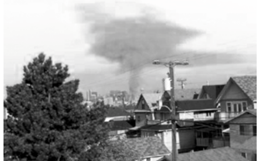
-Spartacus Books burning, the view from East Van